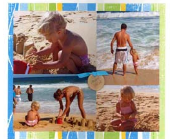
Building Castles in the Sand KAWAII Have had a great time playing on the beach this year... jumping in the waves was fun, but the really had fun building sand castles and then watching them melt... All though, I hope you had the most fun (except people in the sand, especially hermit!) ©2005 2005