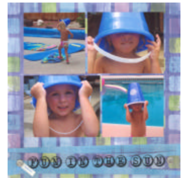
Above layouts based on August Recipe Sketch